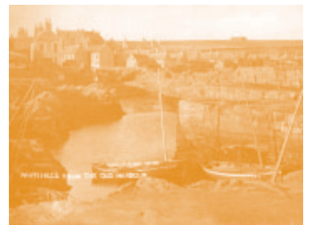
The Old Harbour, Whitehills c. 1815