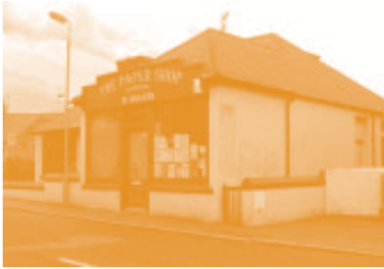
Old paper shop. Could it be the site of a new youth facility?