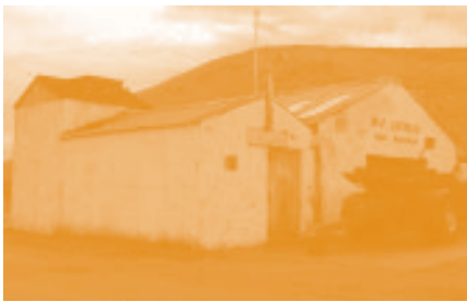
One of the derelict buildings in the Marina area.