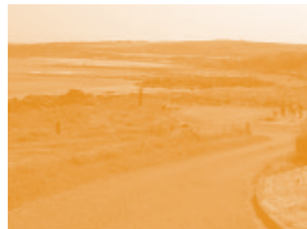
RedWell picnic area.

Many other suggestions received support, and these are listed on pages 6 - 9.