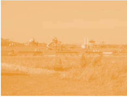
Blackpots Play Park.