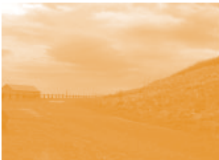
Streetlights needed to Blackpots and caravan park.