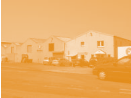
Downies of Whitehills - A major employer.