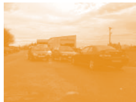
Congestion at Inverboyndie Industrial Estate.

There is support for action by Aberdeenshire Council to clear the beach after winter storms. [P&ES]