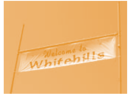
"Welcome to Whitehills" banner

Only one issue was raised under this theme, and it is one of the top priorities (see page 5).