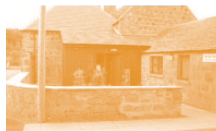
Boyndie Visitor Centre.