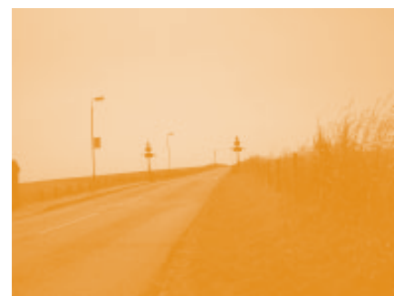
End of the pavement - B9121.